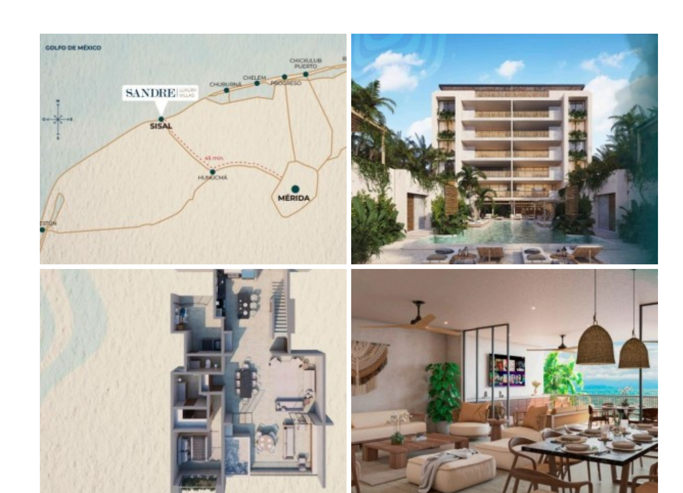
Click here to see the property

Yucatán Properties Calle 30 Número 381 A x 39 y 41 Emiliano Zapata Norte Mérida, Yucatán, México. C.P. 97129 Tel. (52) (999) 9484444 Tel/Fax (52) (999) 9484445 Celular (52) 9992924698 www.yucatanproperties.com