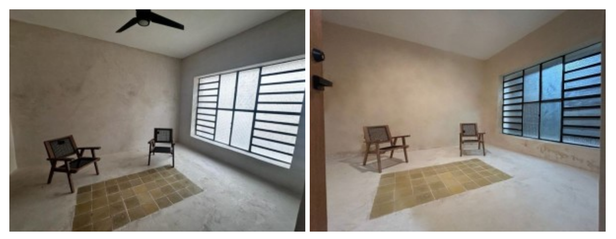
Click here to see the property

Yucatán Properties Calle 30 Número 381 A x 39 y 41 Emiliano Zapata Norte Mérida, Yucatán, México. C.P. 97129 Tel. (52) (999) 9484444 Tel/Fax (52) (999) 9484445 Celular (52) 9992924698 www.yucatanproperties.com