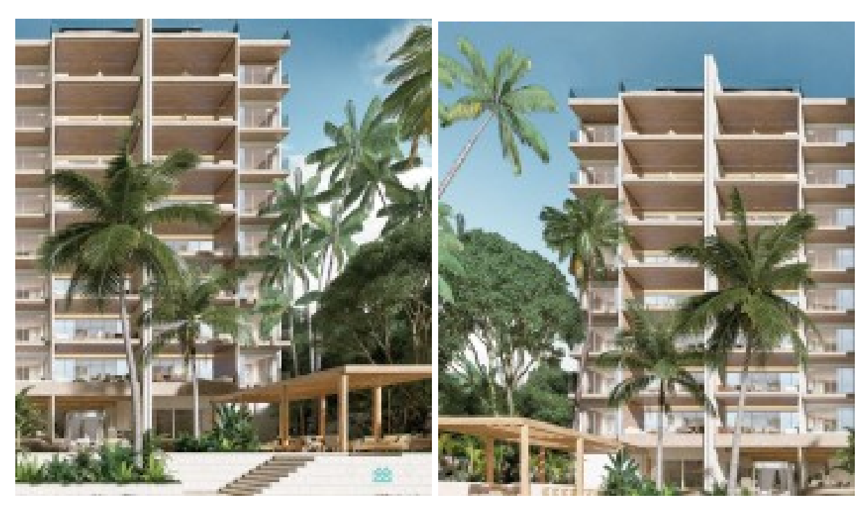
Click here to see the property

Yucatán Properties Calle 30 Número 381 A x 39 y 41 Emiliano Zapata Norte Mérida, Yucatán, México. C.P. 97129 Tel. (52) (999) 9484444 Tel/Fax (52) (999) 9484445 Celular (52) 9992924698 www.yucatanproperties.com